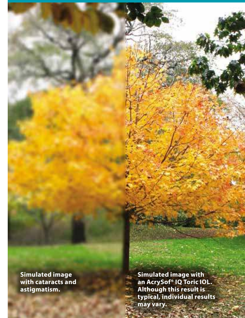
Simulated image with cataracts and astigmatism.