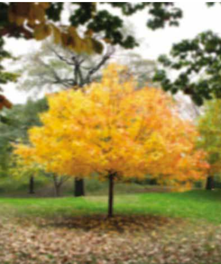
Simulated image with a monofocal IOL and astigmatism

A. Recovery after cataract surgery is generally quick and usually occurs within only a few days. Most patients have improved vision soon after surgery, and your sight may continue to improve for several days or weeks. The actual procedure involves removing the cloudy lens and replacing it with an IOL, such as the AcrySof® IQ Toric IOL.