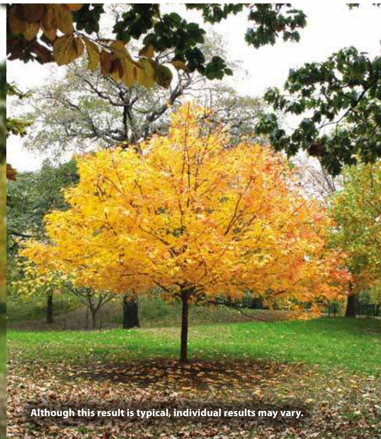
Simulated image with AcrySof® IQ Toric IOL

Although this result is typical, individual results may vary.