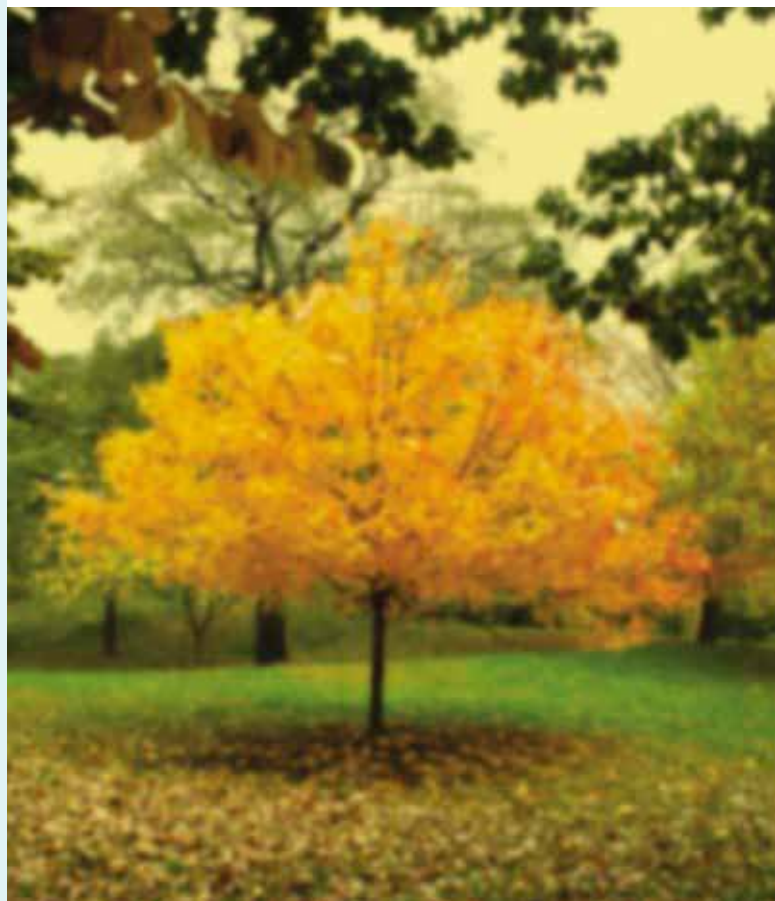
Simulated image with a cataract and astigmatism

A. In clinical trials, the majority of patients with preoperative astigmatism achieved freedom from glasses for distance vision when the AcrySof® IQ Toric IOL was implanted. 1 It's made of the same biocompatible lens material that has already been successfully implanted in more than 100 million people since 1991. 2